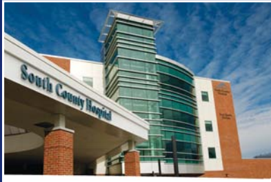
South County Hospital