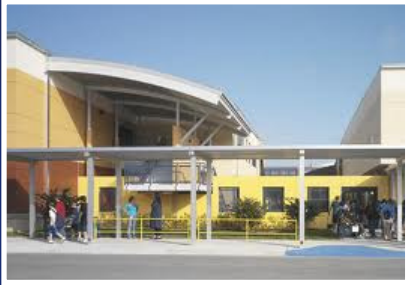
Pinellas County Schools