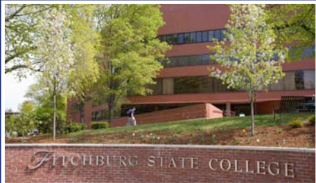
Fitchburg State College